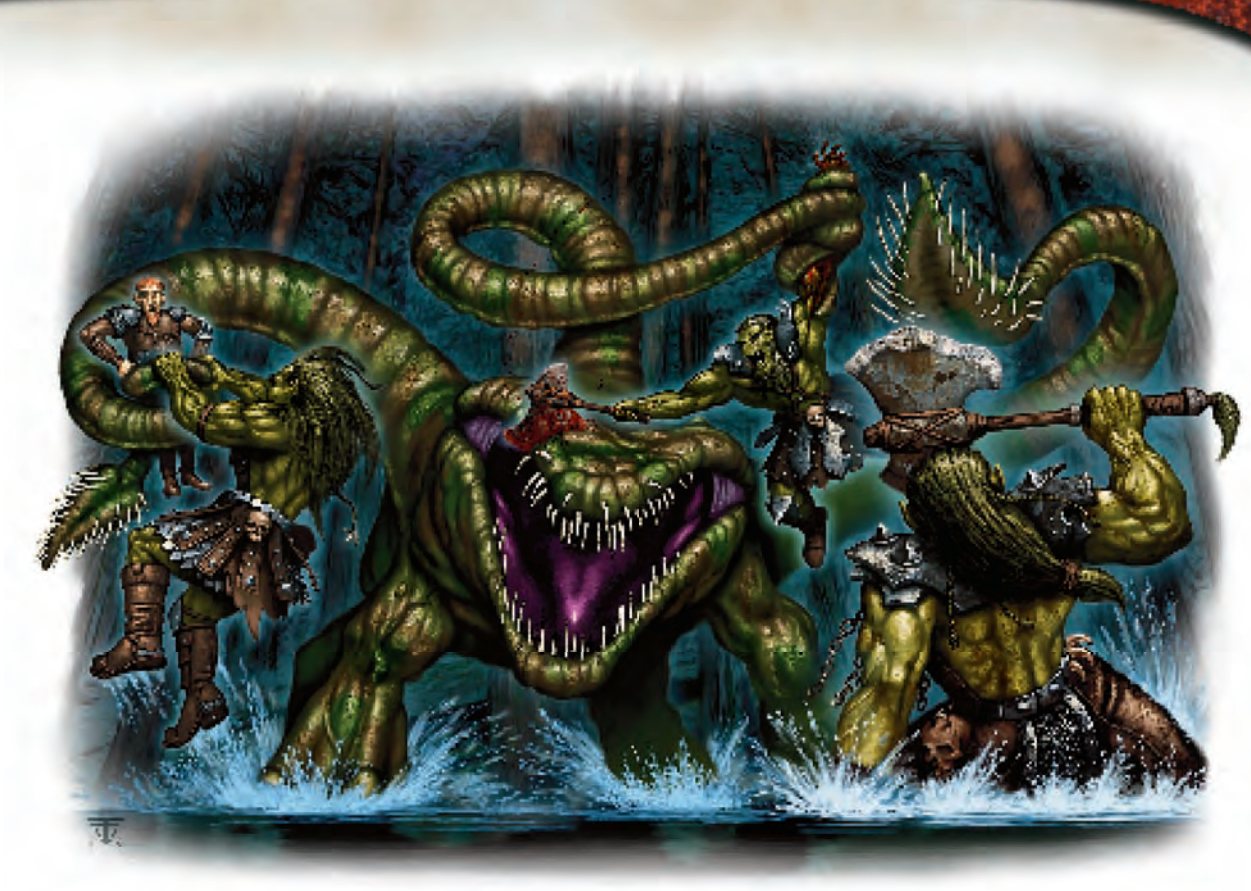
A trio of orcs battle to rescue a gnome from the clutches of an otyugh

by his religion and actions than by his race. Yet each orc tribe has its own way of dealing with outsiders, regardless of the tribe's religion. Knowing an orc's tribe is a much surer way to understand him than simply knowing you're meeting an orc.