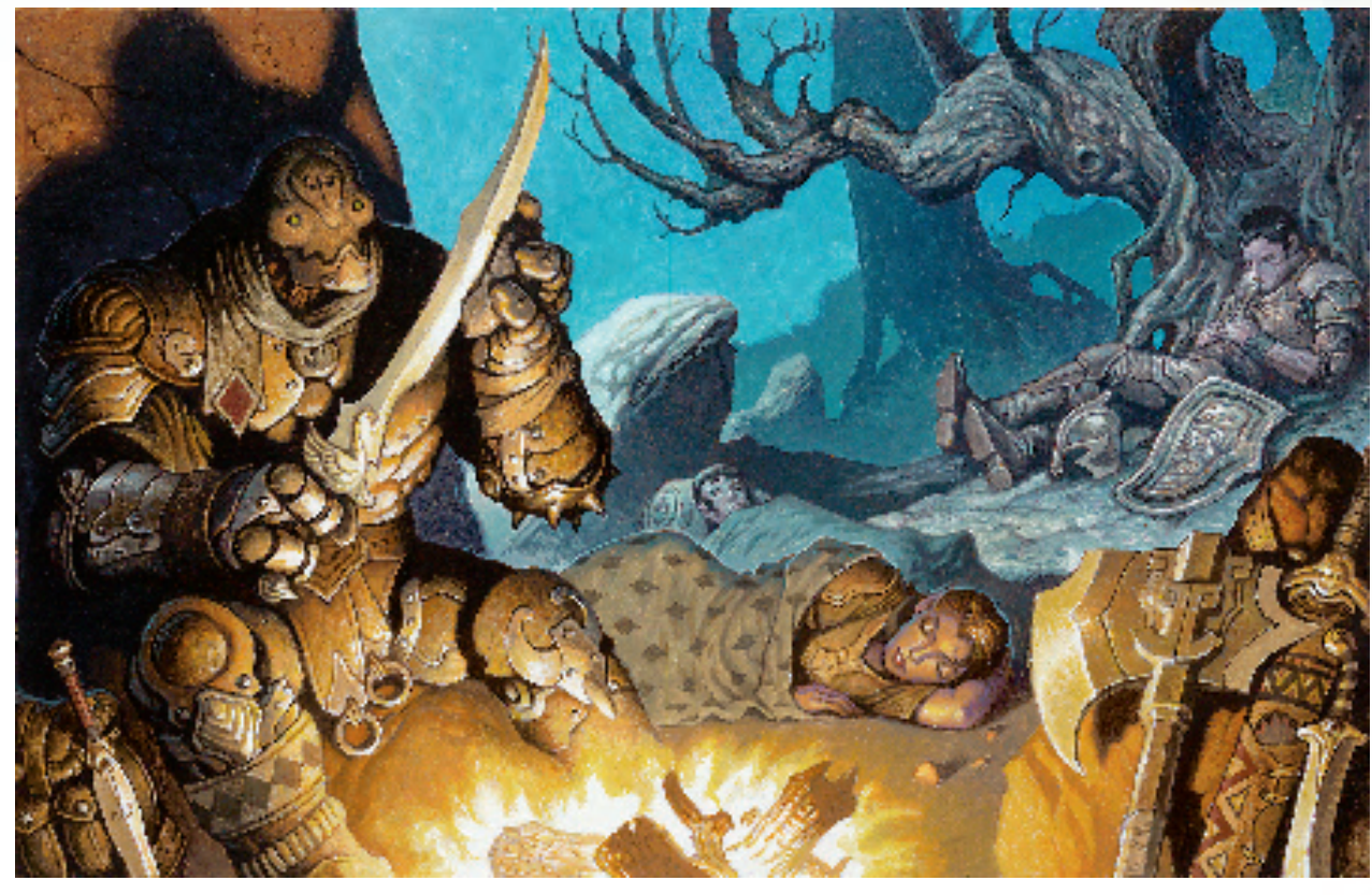
While his comrades ger their rest, a warforged passes the time by sharpening their weapons for them

Warforged learned about other emotions on the battlefield. Most gained a sense of camaraderie from sharing battlefield successes and failures, but few know what real friendship is, and fewer still understand an emotion as complicated as love. Hate comes somewhat more easily to warforged. Warforged who know jealousy can most easily understand hate, but any warforged who cares for his comrades and fears for his life can come to hate an enemy that threatens both.