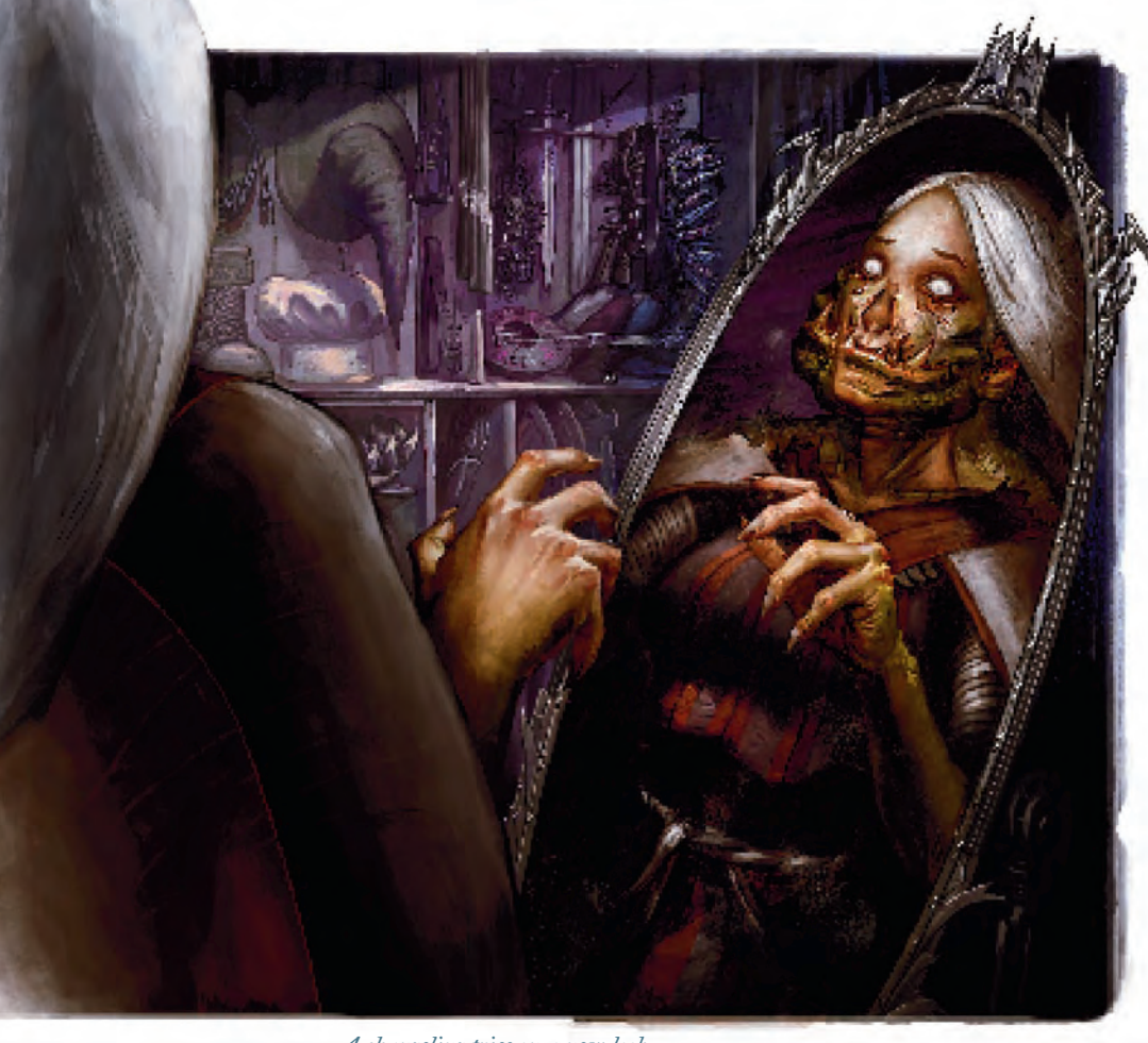
A changeling tries on a new look

The creature looked around, then went into the healer's home and touched her on the shoulder.