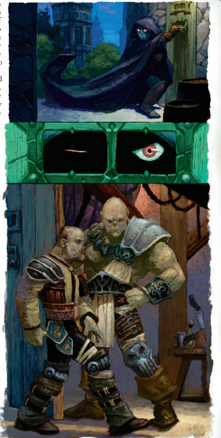
A ready disguise proves useful to a changeling infiltrator

A child uses his minor change shape ability to impersonate someone else. Usually, the game begins