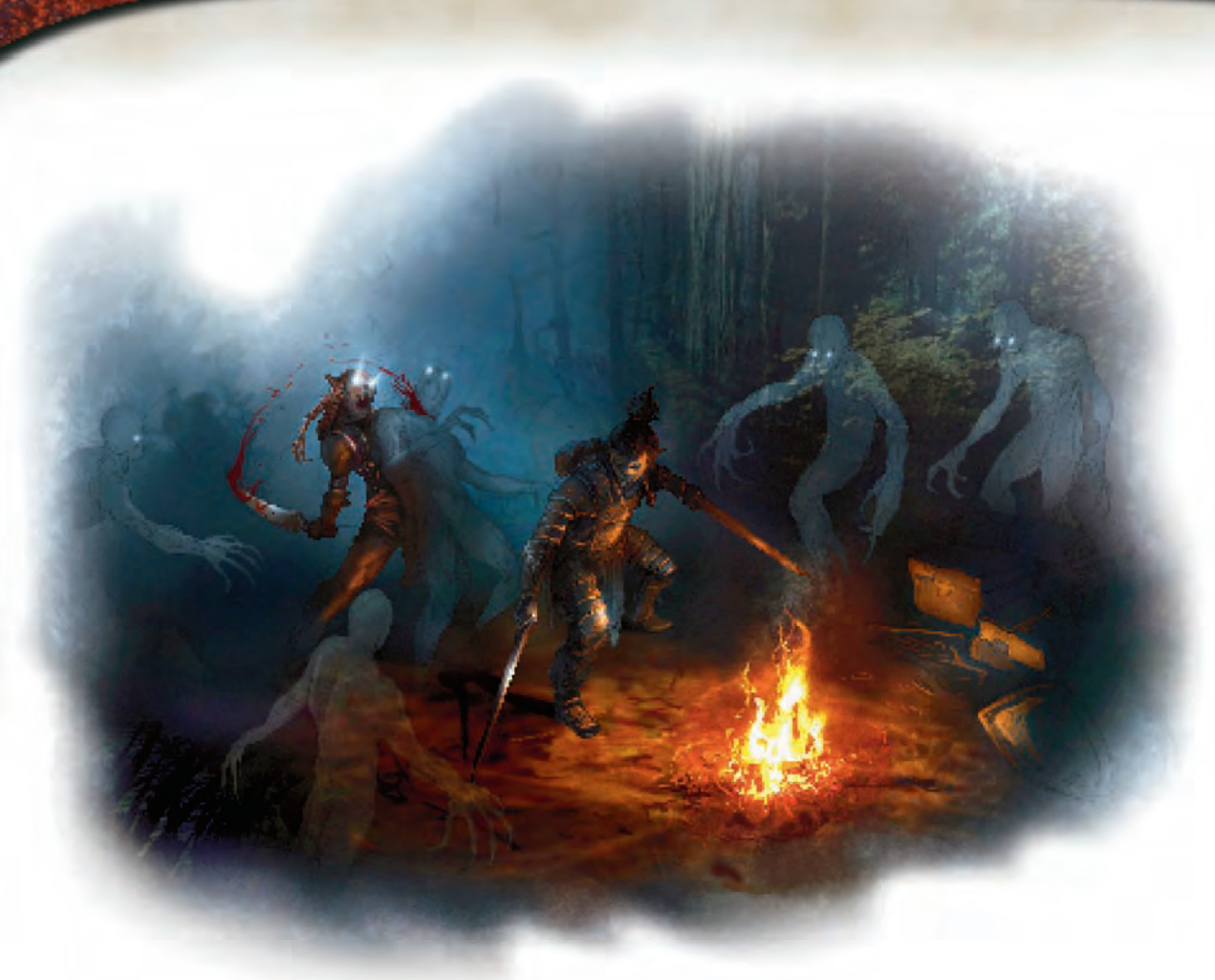
Invisible enemies can't hide from a shifter with the Dreamsight Elite feat

duration of your shifting, you gain a +5 bonus on Spot checks and can see invisible creatures and objects as if under the effect of a see invisibility spell.