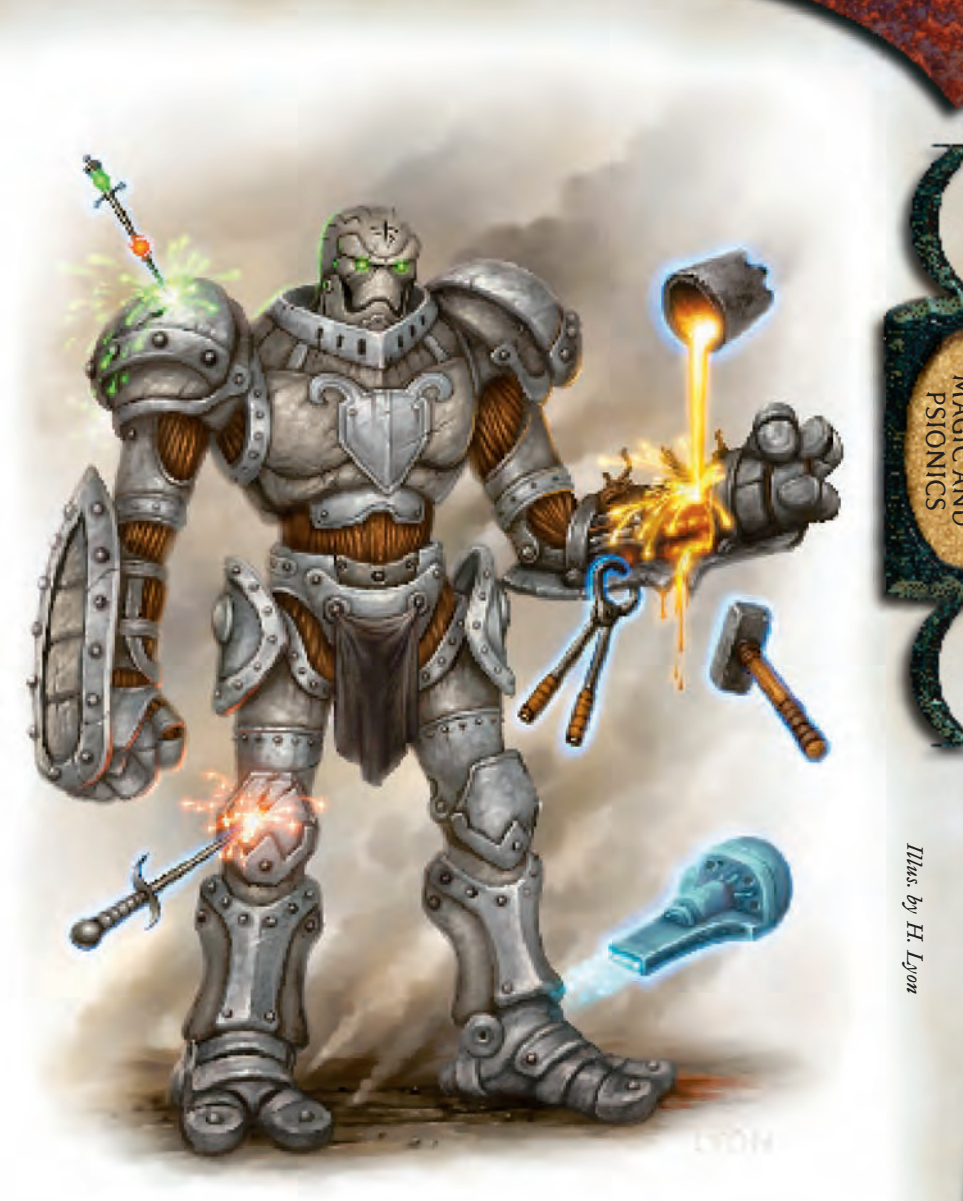
An unseen crafter at work on a damaged warforged

Special: When the unseen crafter is commanded to repair a war-