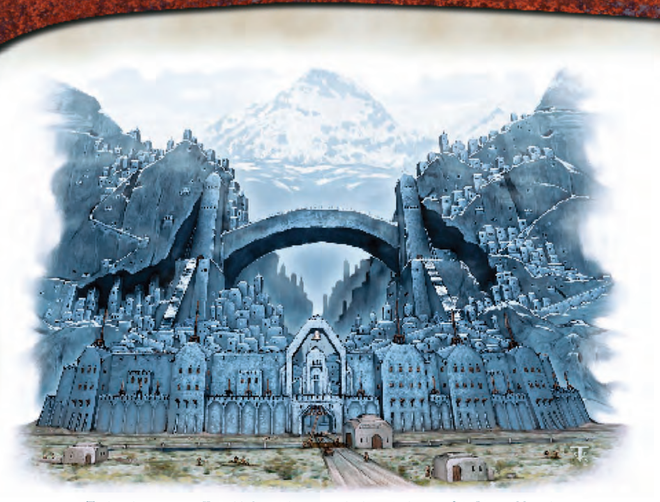
The imposing entrance to Korunda's Gate, a city-stronghold built by the dwarves of the Ironroot Mountains

Lands: The Mror Holds stretch throughout the Ironroot Mountains, a dangerous and forbidding range at the northeastern edge of Khorvaire. The dwarves live in a hard and hostile climate. Over the last nine hundred years, the Mror Holds have used the incredible riches of their homeland to build themselves into an economic powerhouse. Still, in their own lands they are faced with ever-present danger, not just from orcs, trolls, and other monsters, but from the cold, barren land itself.