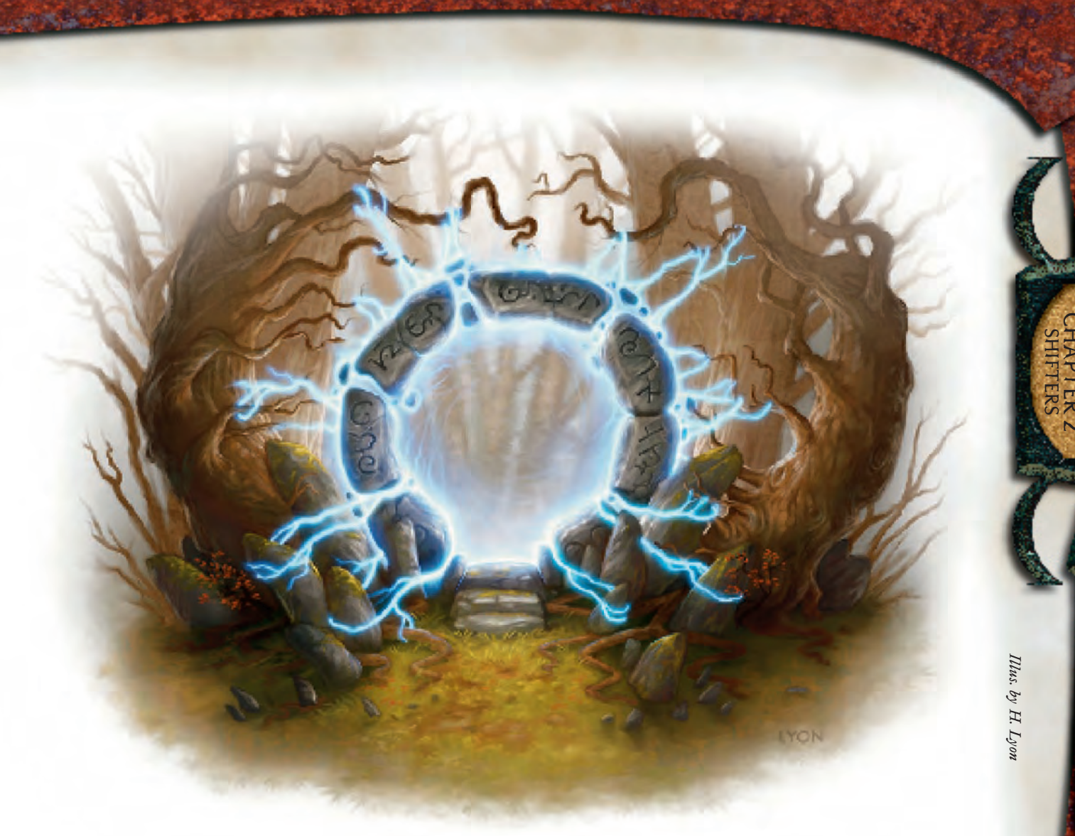
Shifter druids defend the world from the horrors that lie beyond the Changegate

persecution at the hands of the Church of the Silver Flame or its bond to animals and lycanthropes. Each bit of shifter history described below has an associated adventure hook, which describes a possible way you can work the event into an ongoing campaign or a character's background.