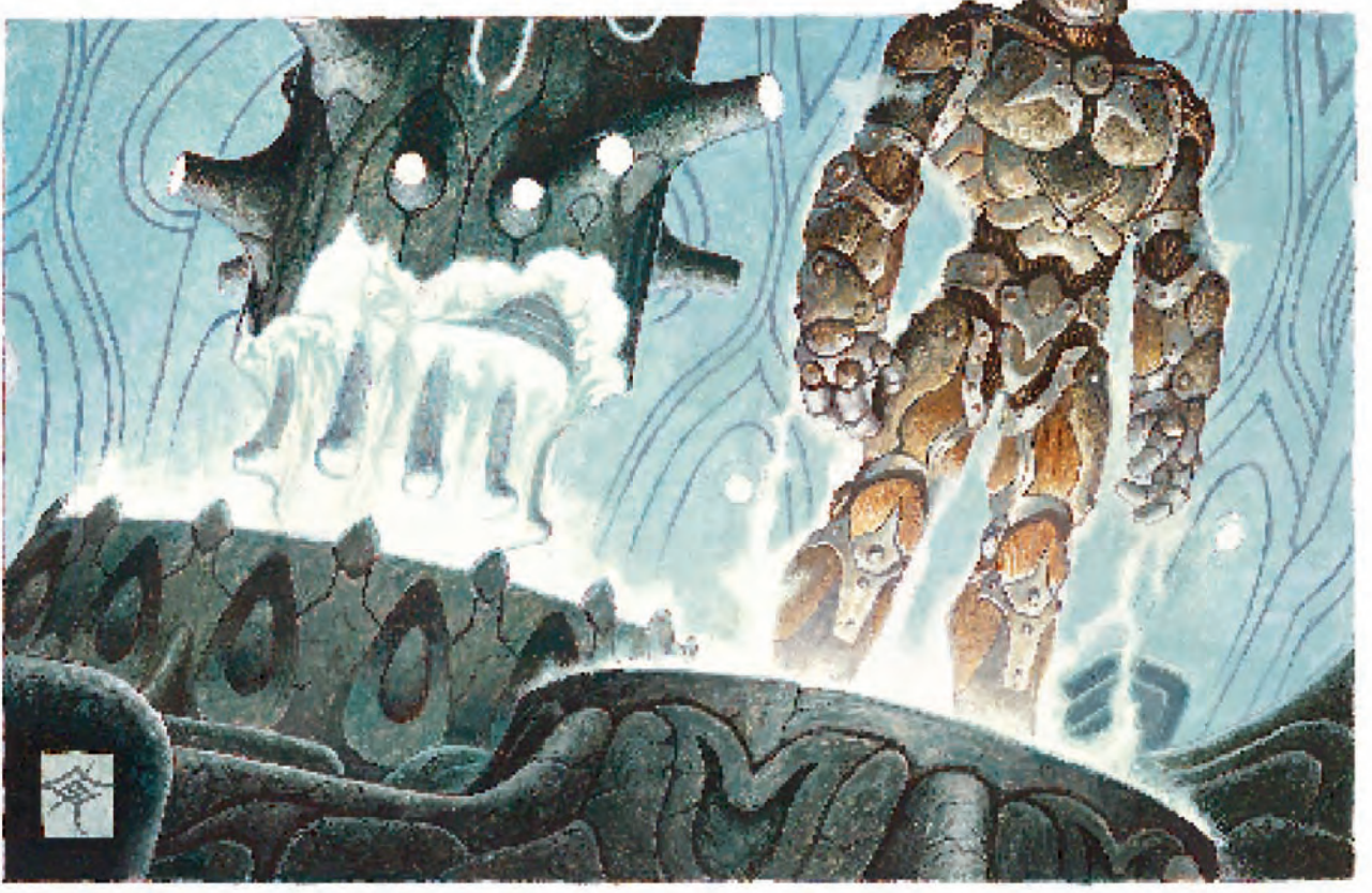
A newly constructed warforged emerges from its creation forge

races find that language can be a barrier