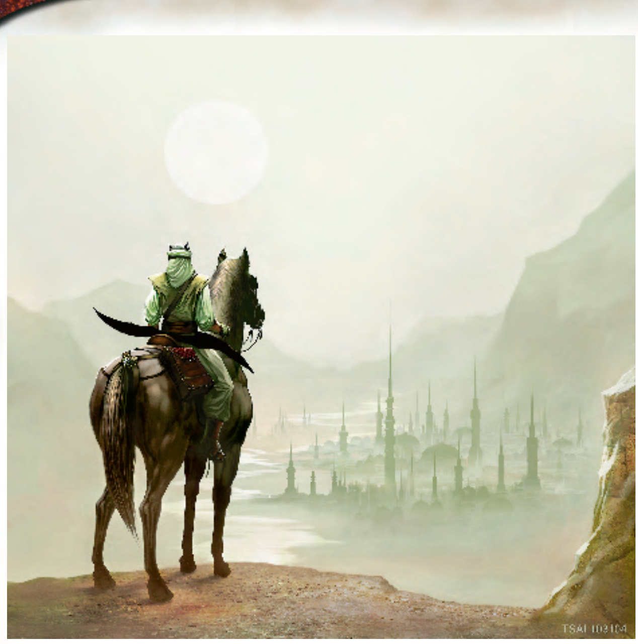
A Valenar elf scout approaches the majestic city of Taer Valaestas

Atk +5 melee (1d6+2/18–20, masterwork scimitar) or +6 ranged (1d8+2/×3, masterwork composite longbow); Full Atk +5 melee (1d6+2/18–20, masterwork scimitar) or +6 ranged (1d8+2/×3, masterwork composite longbow) or +4/+4 ranged (1d8+2/×3, masterwork composite longbow); SA favored enemy (humans +2); SQ elf traits, low-light vision, wild empathy +3 (–1 magical beasts); AL CN; SV Fort +3, Ref +6, Will +1 (+3 vs. enchantments); Str 15, Dex 16, Con 11, Int 10, Wis 12, Cha 8.