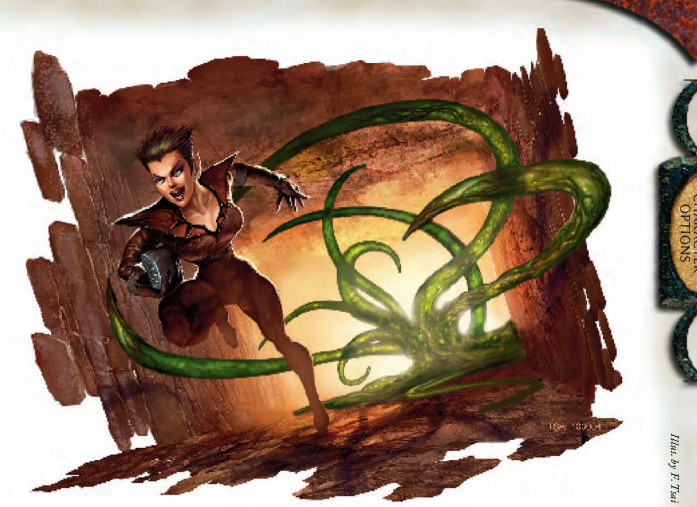
A halfling with the Relic Hunter feat escapes a cavern clutching her prize

use magic items or spells keyed to race, for example). You can also ignore the normal penalty on Disguise checks when disguising yourself as a different race (see the Disguise skill description, page 72 of the Player's Handbook ).